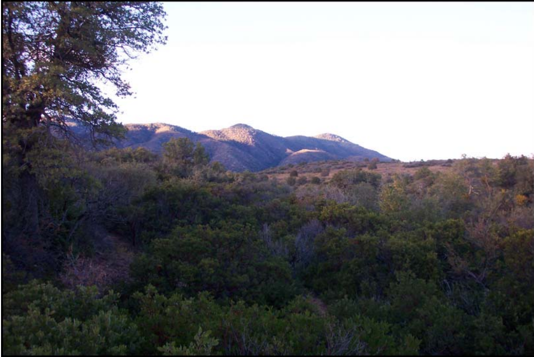
Photo [6] - Vacant deeded land with the Pinal Mountains in the background