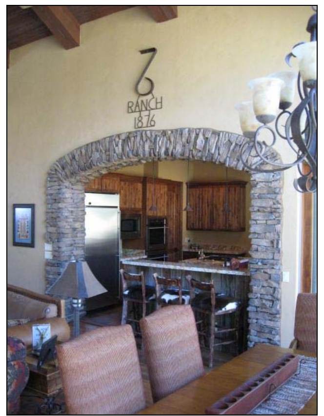
Interior owner's home