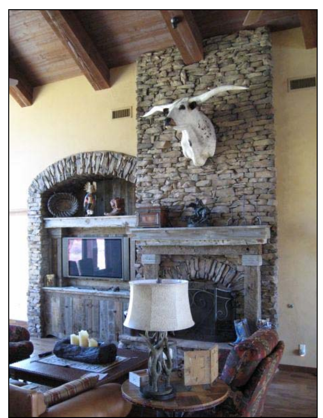
Interior owner's home