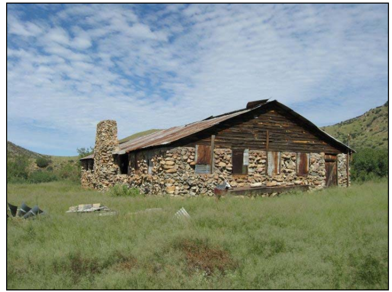
Old stone house