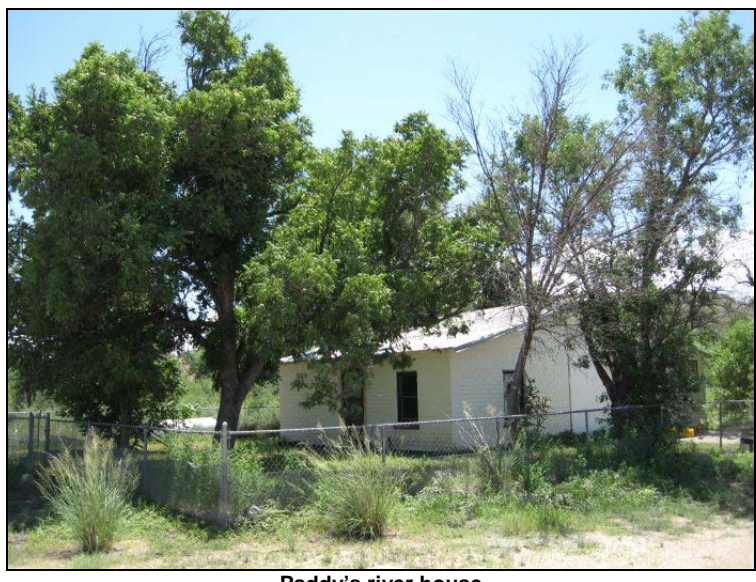
Paddy's river house