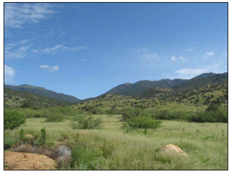
View of the ranch