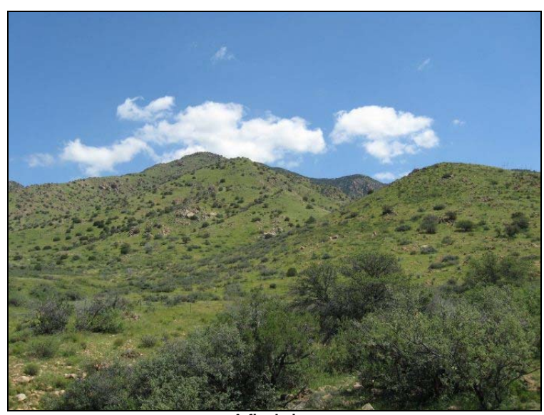
A final view