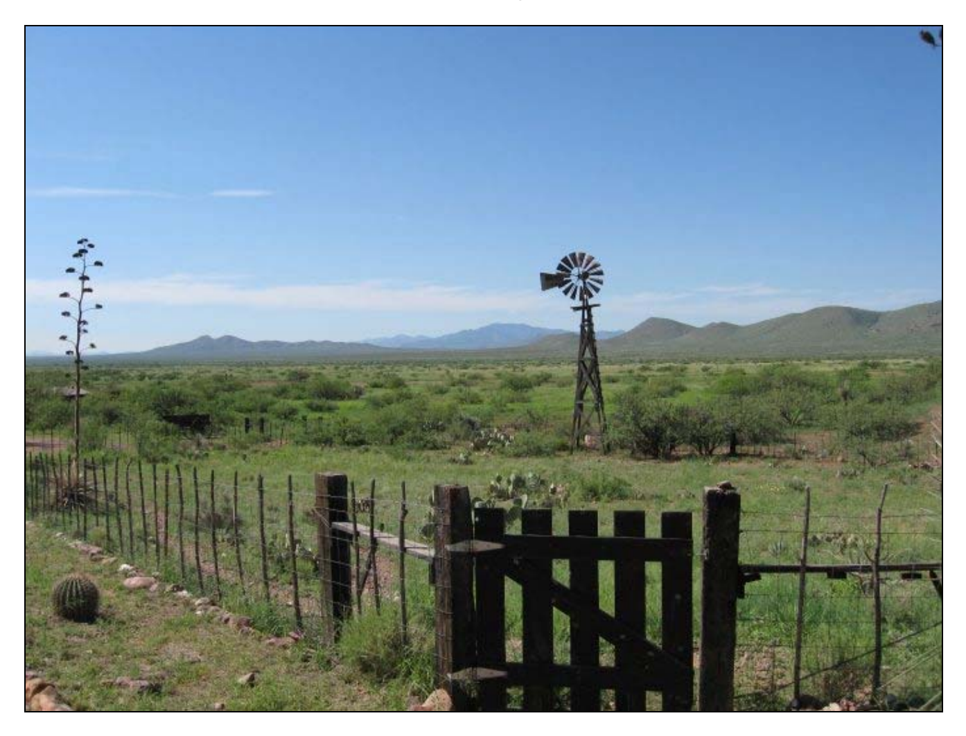
XIA Ranch Cochise County, Arizona