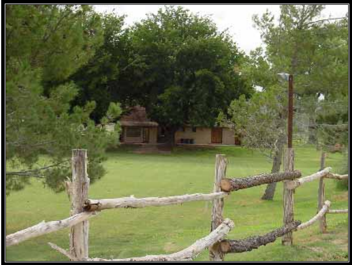
Yard Area and Lodge

The Verde Valley has a semi-arid climate with the majority of rainfall occurring during July and August. Rainfall averages approximately 12 inches annually. Summers are characterized by warm days and cool nights. During July and August, temperatures often range from the low sixties in the mornings to afternoon temperatures in the upper nineties. The winters are characterized by mild days, often rising to the high fifties or low sixties in the early afternoon. Winter nights can be cold, with early morning minimum temperatures typically in the low thirties.