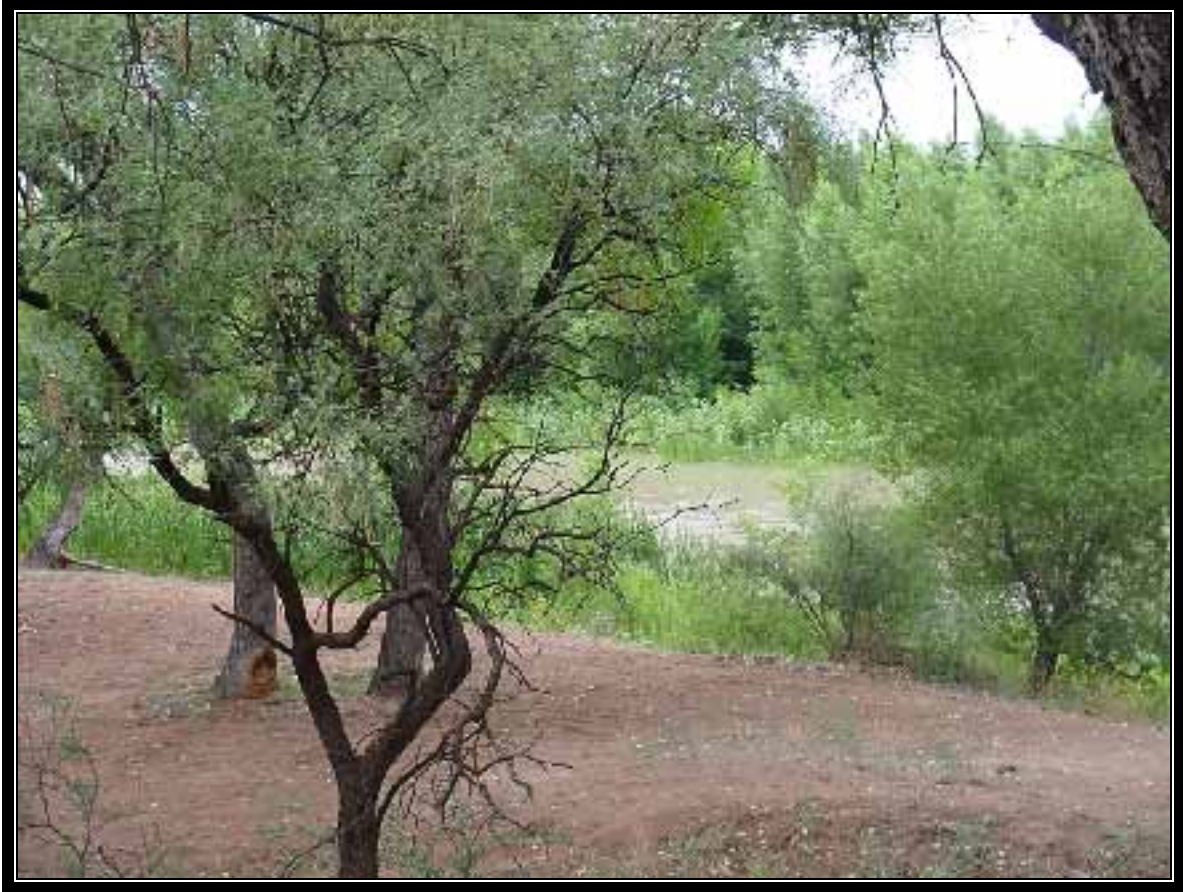
Verde River Frontage