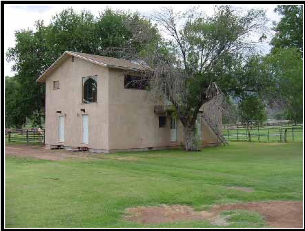
New Office/Apartment under Construction

This information was obtained from sources deemed reliable but is not guaranteed by the broker. Prospective buyers should check all the facts to their satisfaction. The property is subject to prior sale, price change or withdrawal.