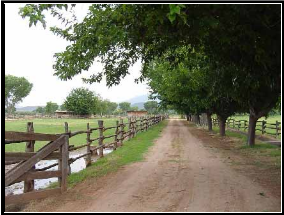
Lane between Irrigated Pastures

The Rockin' River Ranch is a horse ranch and retreat along the southwest banks of the Verde River. It contains 209± acres deeded and an 880± Acre U.S. Forest Grazing Permit. The property is currently operating as a horse ranch and recreational retreat. The deeded land consists of approximately 54 acres of flood-irrigated fields that have been divided into six pastures. The balance of the property is utilized for building sites, riparian/river and open rangeland. The buildings include a large main dwelling/lodge, an owners dwelling, a managers dwelling, a bunkhouse, two horse barns a tack room, a storage building and a shop. There is also a new building under construction that will include an office, two apartments, and public restrooms. Also included is a large roping arena with announcer stand, shipping corrals, a round pen and a hot walker. The grounds are beautifully landscaped with large grass areas with pine and cottonwood trees as well as abundant riparian and other natural desert vegetation.