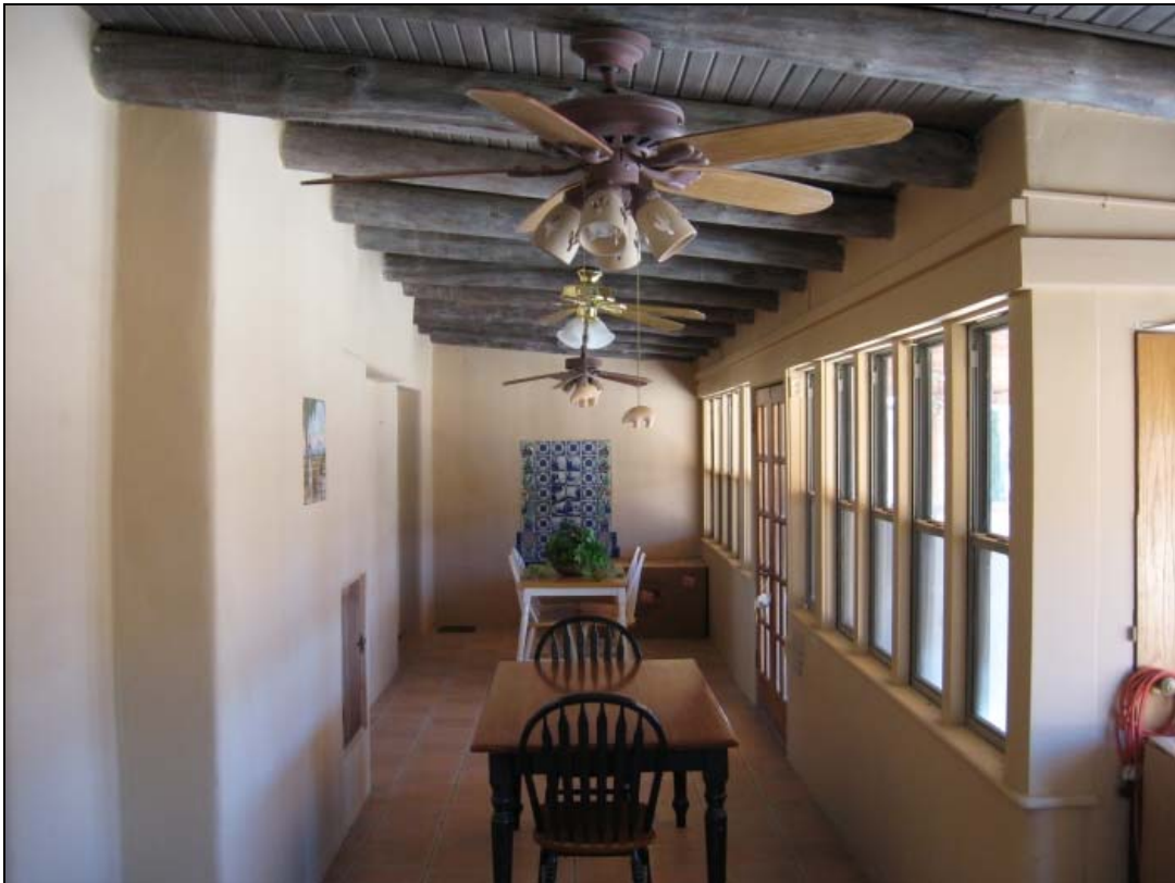
Arizona room in the owner's home