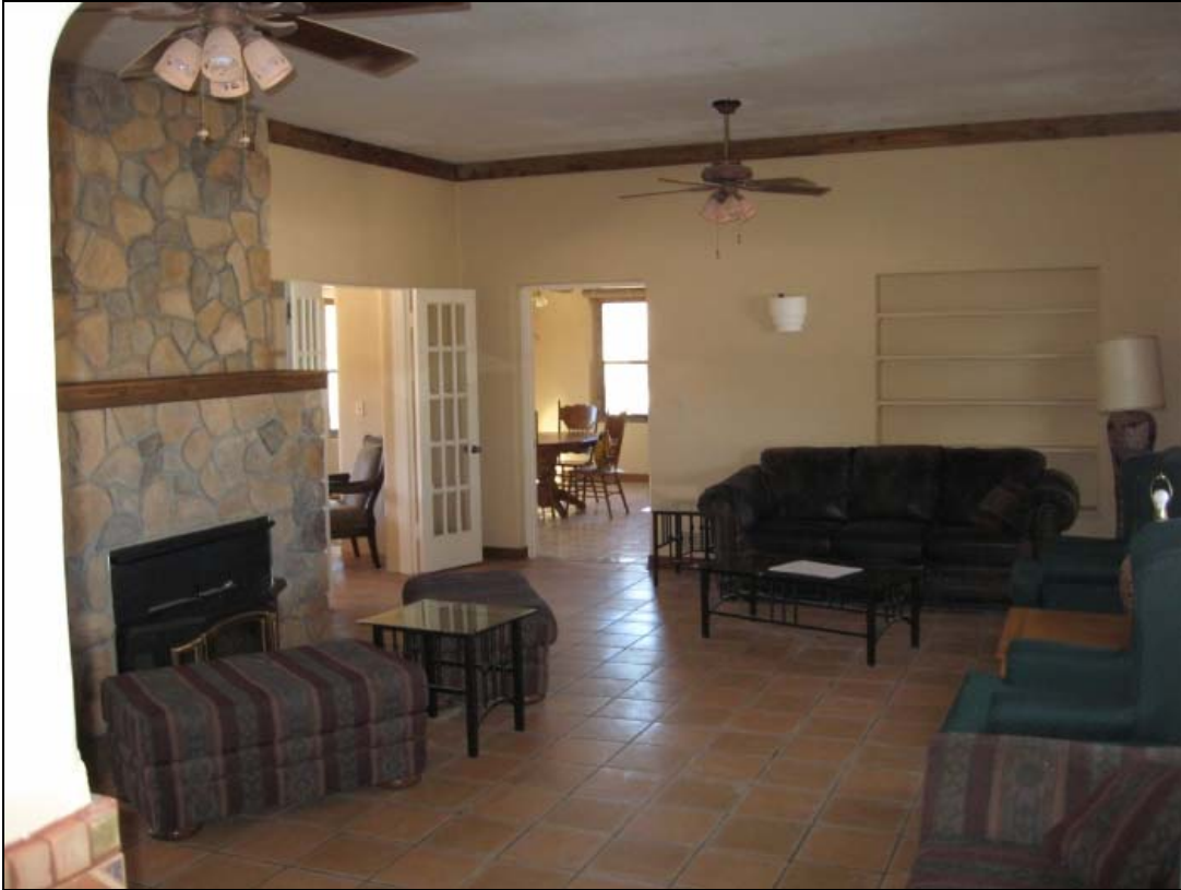
Living room in the owner's home