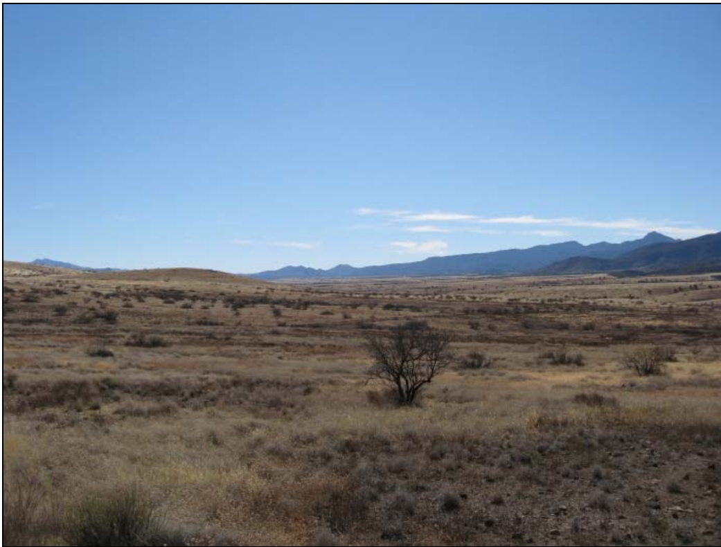
View S towards 960 acre parcel