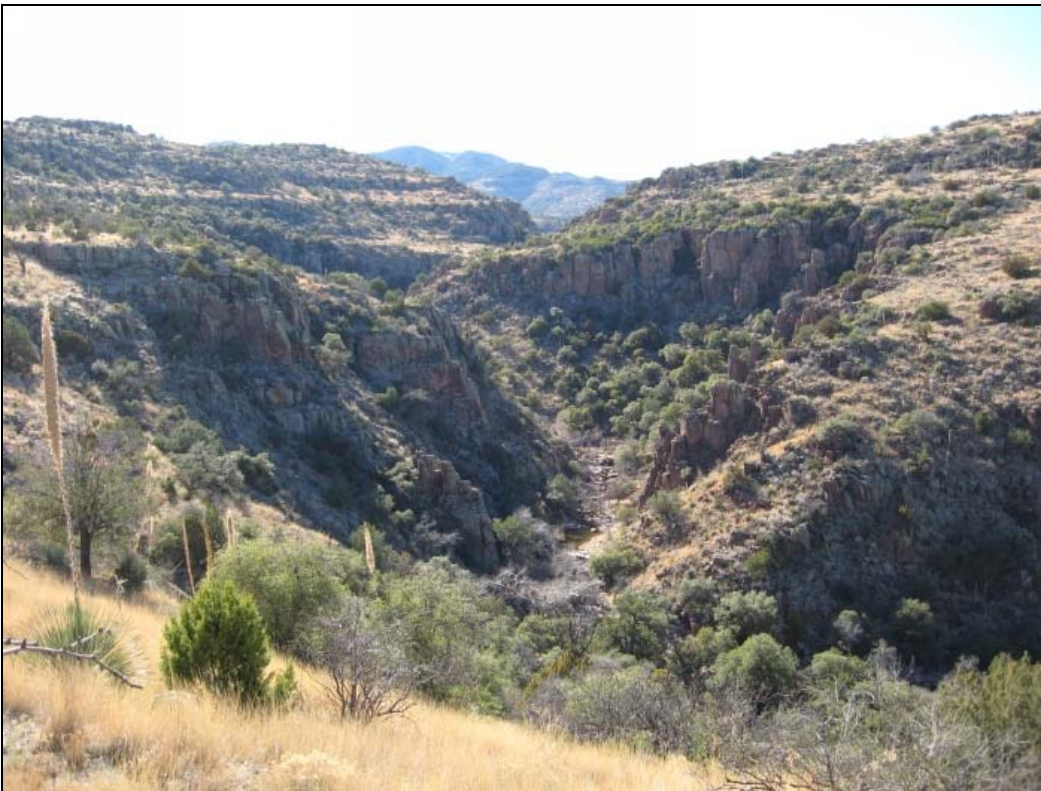
Oak creek on Forest Allotment