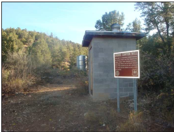
Gaddis Canyon Well shared with Verde Allotment.