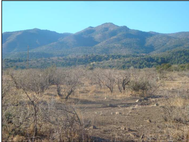
Southwestern view in Cottonwood Pasture.