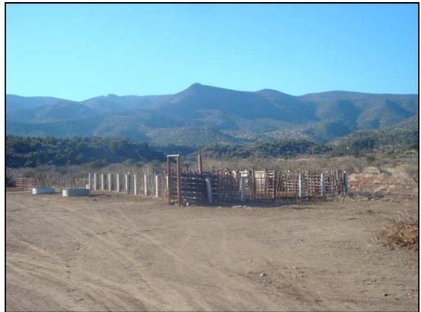
Lucky Canyon Corrals.