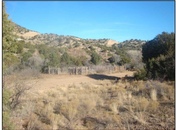
Corrals in Copper Canyon.