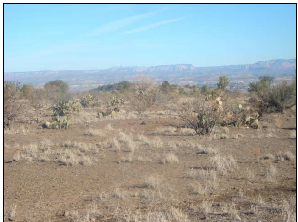
View of Red Rock Country from the Allotment.

Disclaimer: This information was obtained from sources deemed to be reliable but is not guaranteed by the Broker. Prospective buyers should check all the facts to their satisfaction. The property is subject to prior sale, price change, or withdrawal.