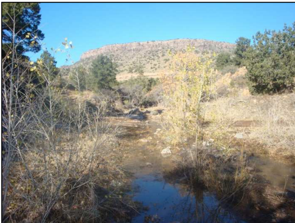
Copper Canyon Creek.