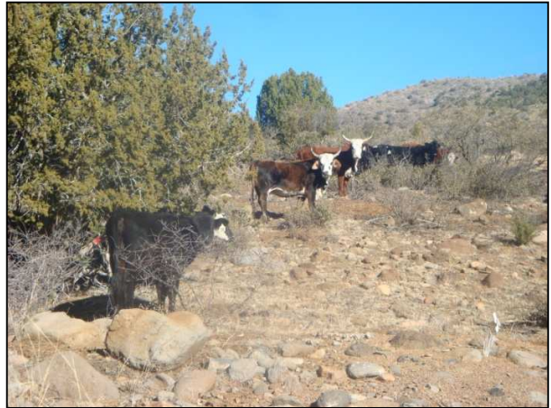
Cross bred cows.