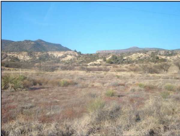
Eastern end of Allotment.