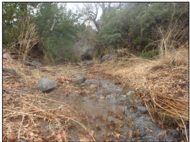
Copper Canyon Creek.