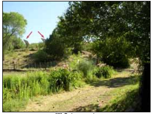
[7] Solar panels