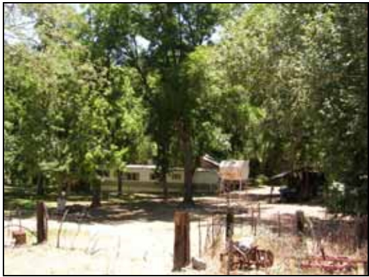
[5] Residence and shed