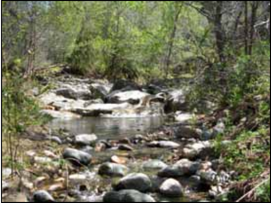
[2] Coon Creek