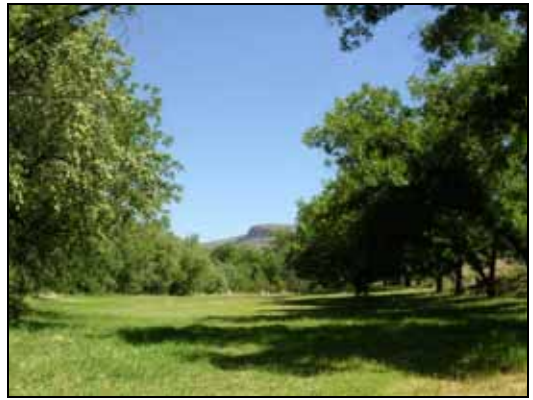
[6] Irrigated pasture