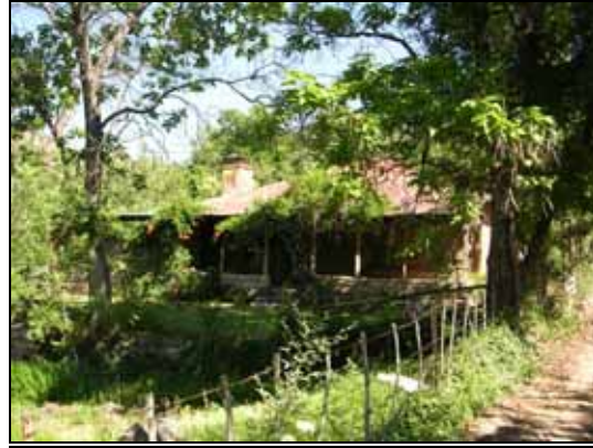
[11] Historic (1918) adobe house