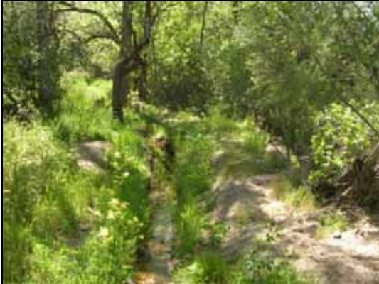
[3] Irrigated ditch