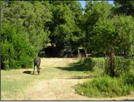
[10] Real estate broker