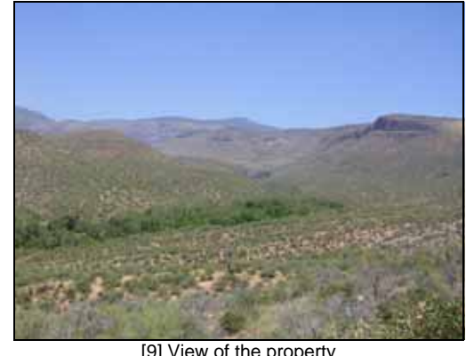
[9] View of the property