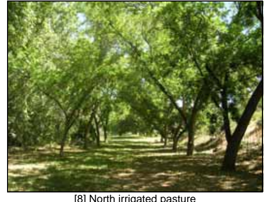
[8] North irrigated pasture