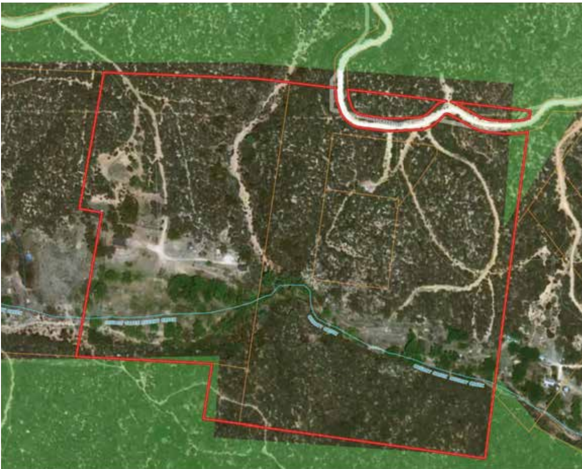
CSR Aerial Map

Water Rights: approximately 2.0 acres have historically been irrigated by surface water dating prior to 1900 and has been acknowledged by SRP. There is a total of approximately 27 acre feet of water rights with the property. The uses stated for the water rights include domestic, irrigation, livestock and wildlife uses.