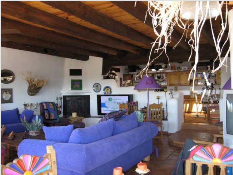
Interior owner's home