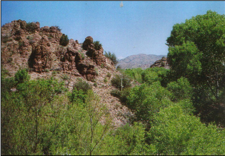
Mineral Creek riparian area