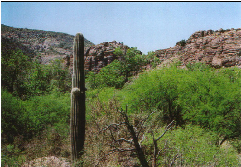
Mineral Creek riparian area