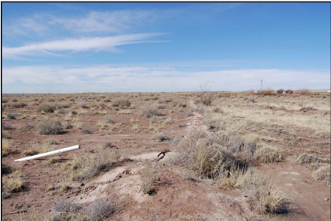
Fallow field with underground pipe.

P. O. BOX 1980 ST. JOHNS, ARIZONA 85936 TELEPHONE 928 524-3740 FAX 928 563-7004