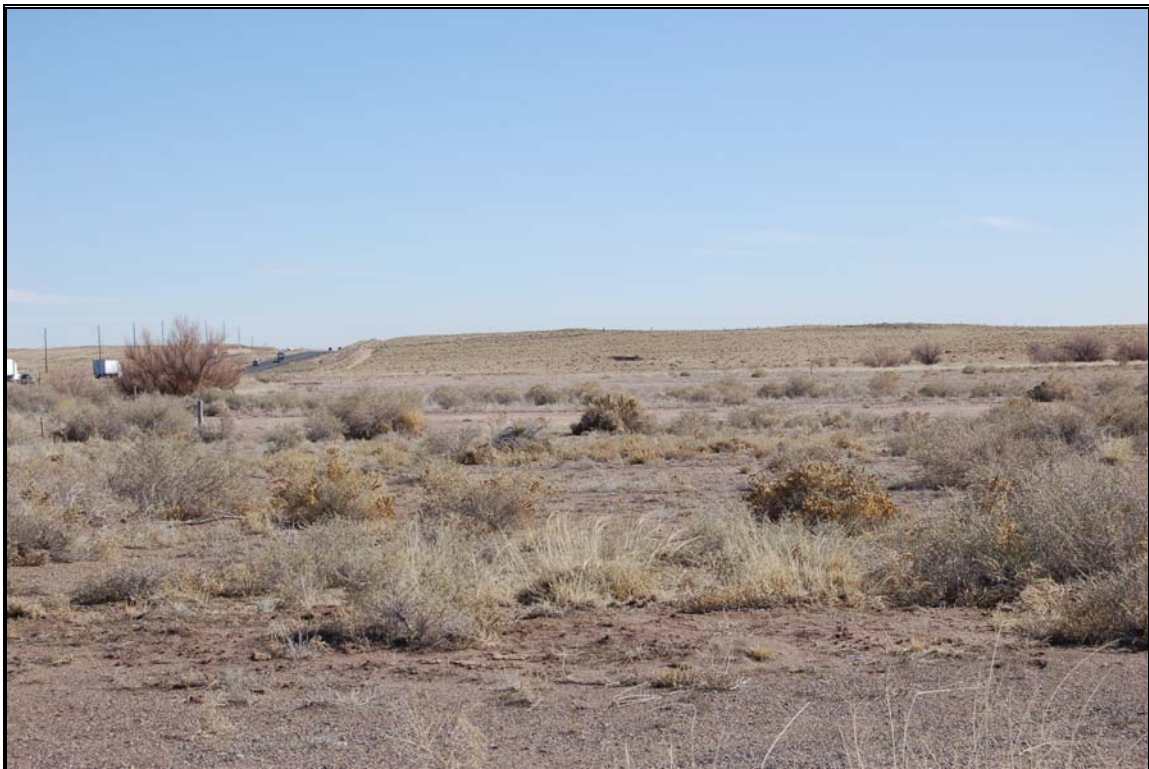
Additional Interstate 40 frontage.

P. O. BOX 1980 ST. JOHNS, ARIZONA 85936 TELEPHONE 928 524-3740 FAX 928 563-7004