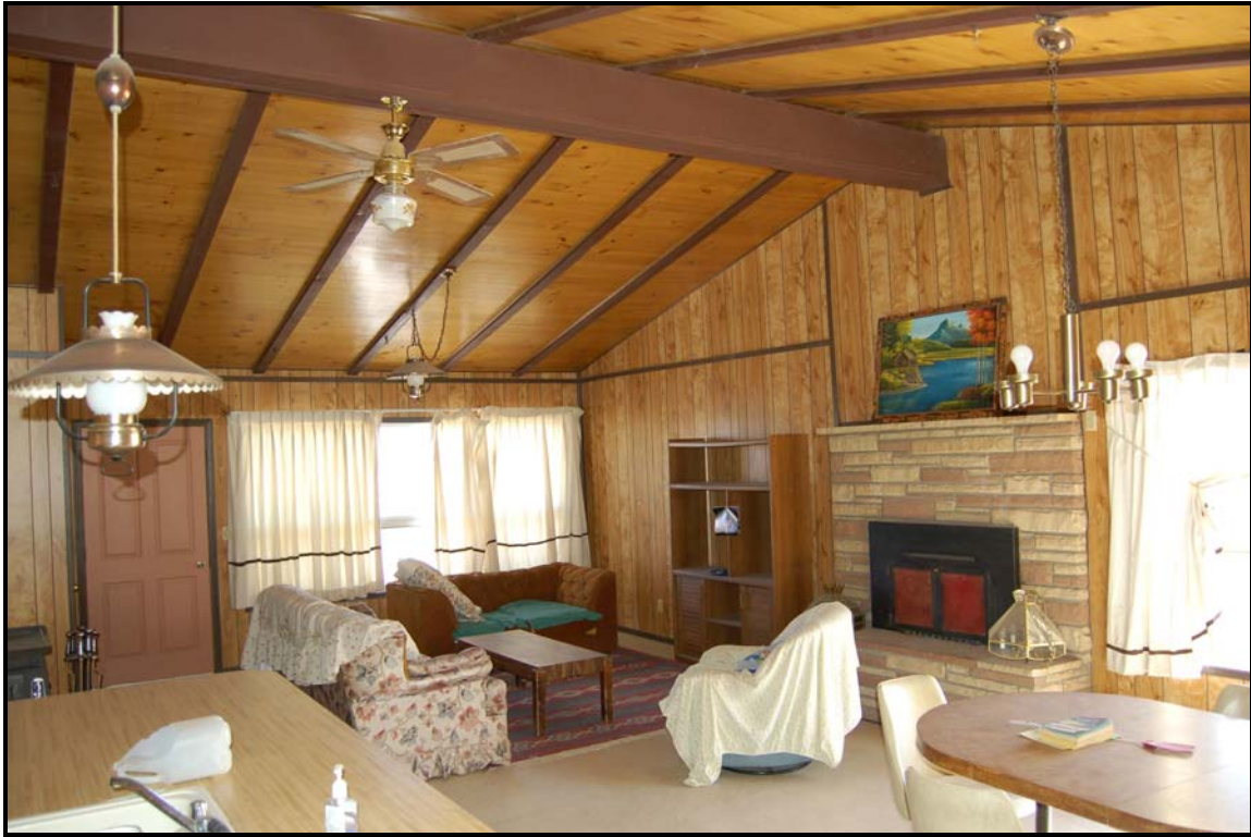
Living room with fireplace in main house.