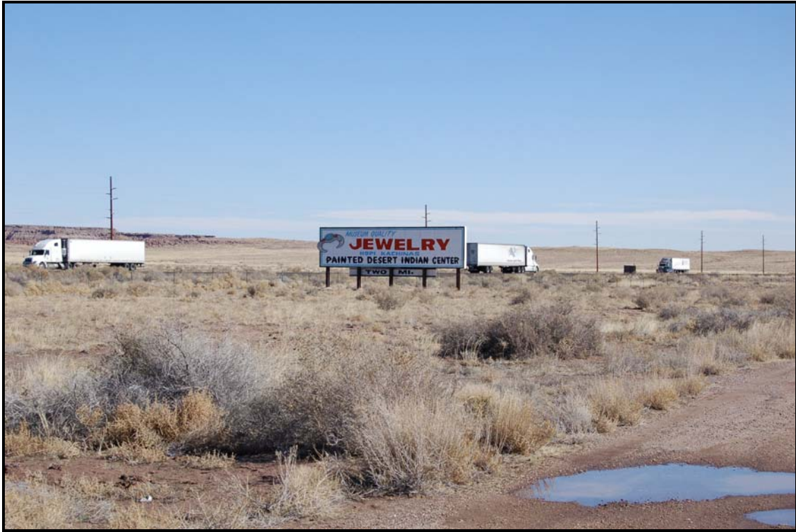
Interstate 40 with billboard on property.