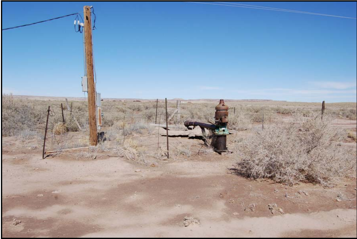
Another irrigation well.