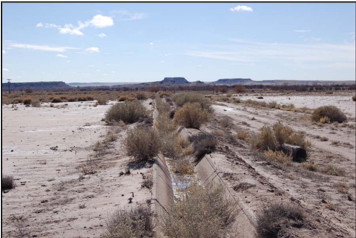
Concrete ditch for one of the fields.

P. O. BOX 1980 ST. JOHNS, ARIZONA 85936 TELEPHONE 928 524-3740 FAX 928 563-7004