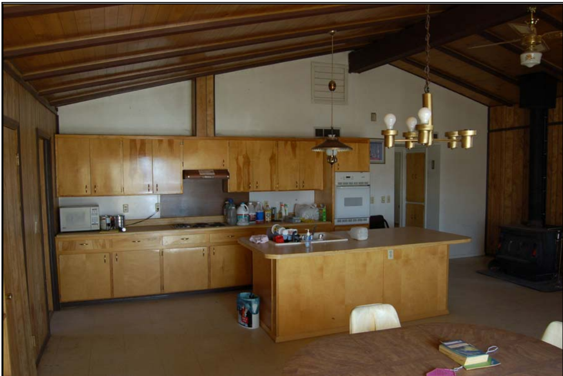
Kitchen in main house.

P. O. BOX 1980 ST. JOHNS, ARIZONA 85936 TELEPHONE 928 524-3740 FAX 928 563-7004