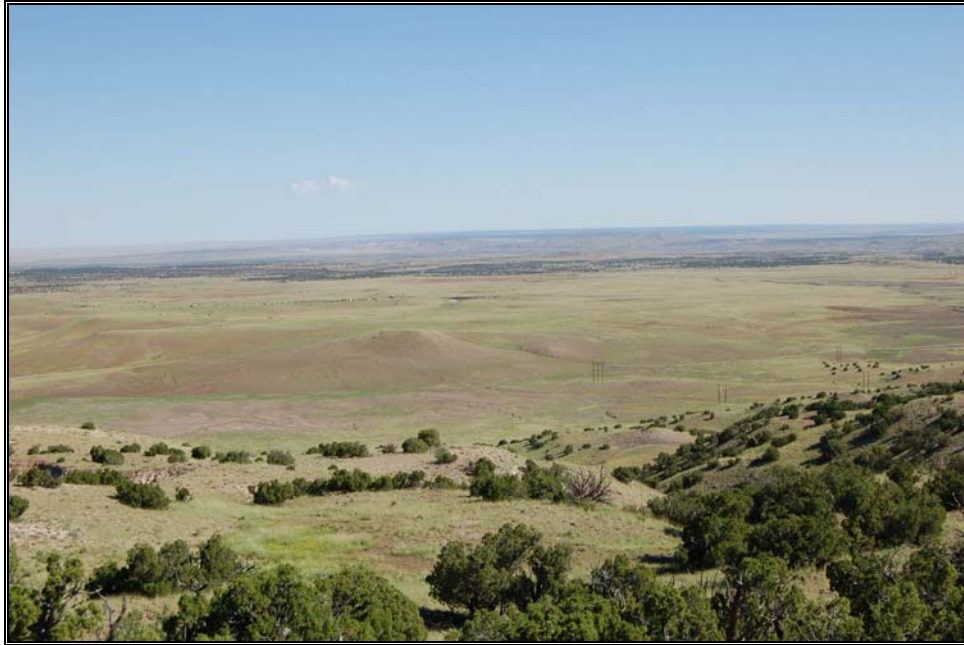
Northern portion of the ranch looking from Mormon Hill.

FARM, RANCH, AGRIBUSINESS REAL ESTATE SALES & SERVICES