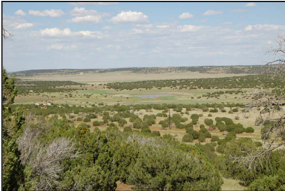
Overview looking west with dirt tank in distance.

P. O. BOX 1980 ST. JOHNS, ARIZONA 85936 TELEPHONE 928 524-3740 FAX 928 563-7004