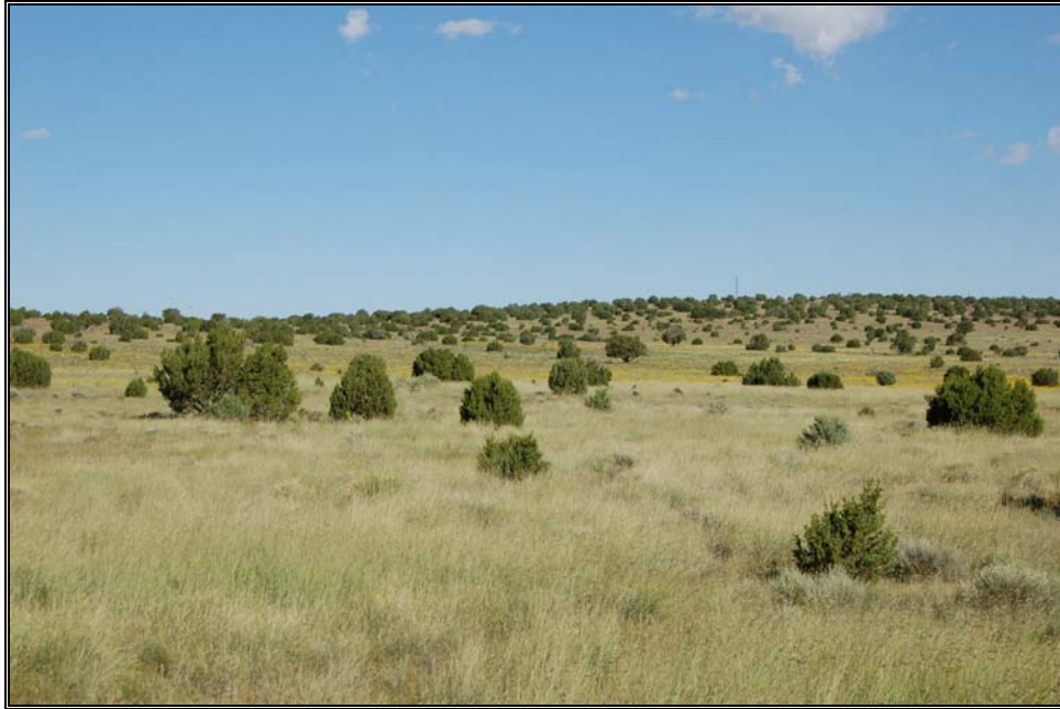
View looking south from highway 61.

FARM, RANCH, AGRIBUSINESS REAL ESTATE SALES & SERVICES