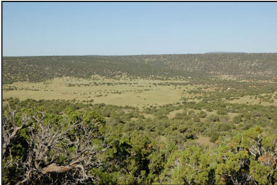
View looking north over Round Valley.

P. O. BOX 1980 ST. JOHNS, ARIZONA 85936 TELEPHONE 928 524-3740 FAX 928 563-7004