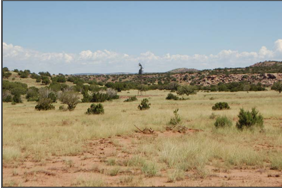
Windmill in the central part of the ranch.

FARM, RANCH, AGRIBUSINESS REAL ESTATE SALES & SERVICES