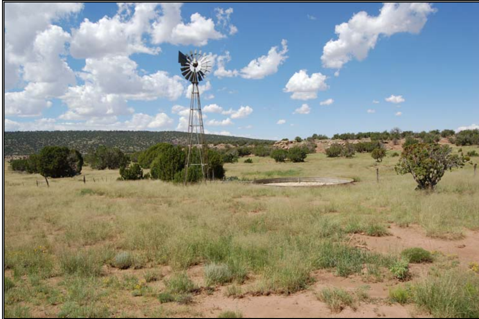
Round Valley well.

FARM, RANCH, AGRIBUSINESS REAL ESTATE SALES & SERVICES