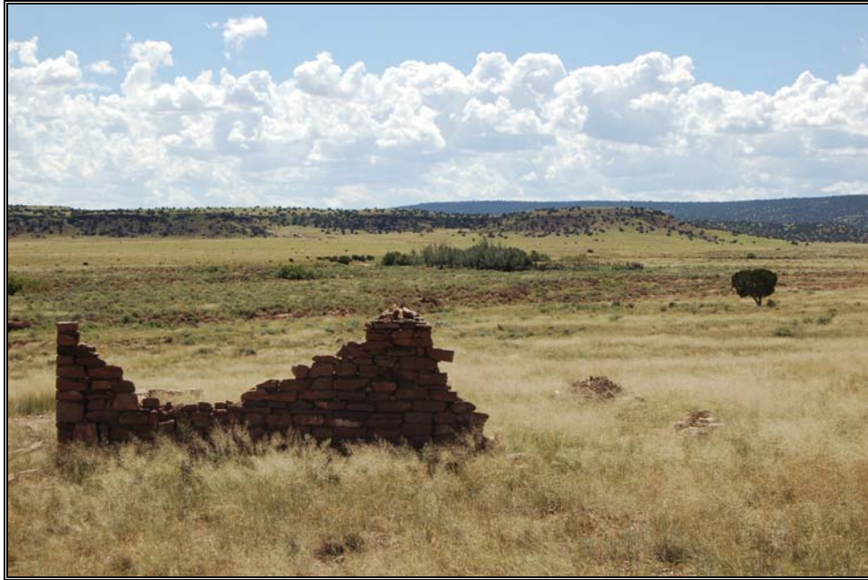
Mail Station Draw near the north boundary.

FARM, RANCH, AGRIBUSINESS REAL ESTATE SALES & SERVICES