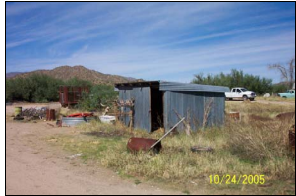
[4] Tack shed