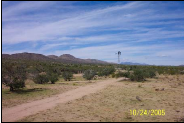
[12] Misery windmill

Disclaimer: This information was obtained from sources deemed to be reliable but is not guaranteed by the Broker. Prospective buyers should check all the facts to their satisfaction. The property is subject to prior sale, price change, or withdrawal.