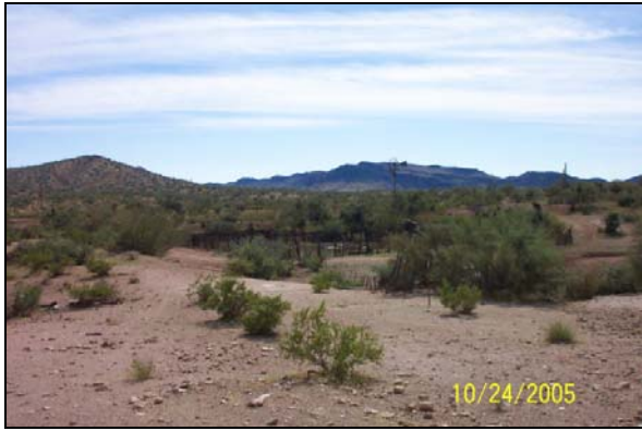
[10] Baker windmill