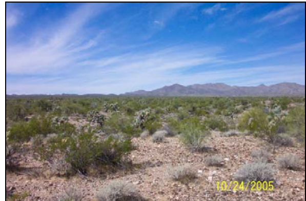
[6] Typical rangeland on Northern portion of Ranch