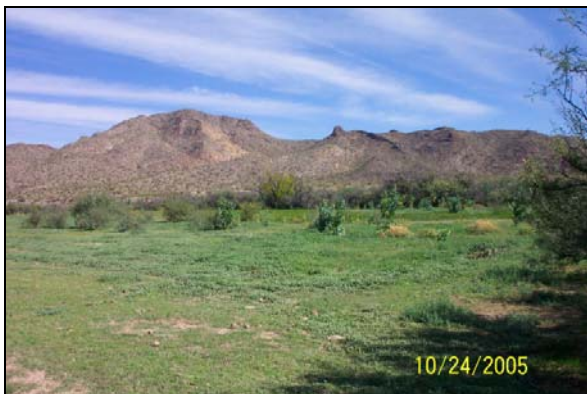
[7] Irrigated pasture at headquarters