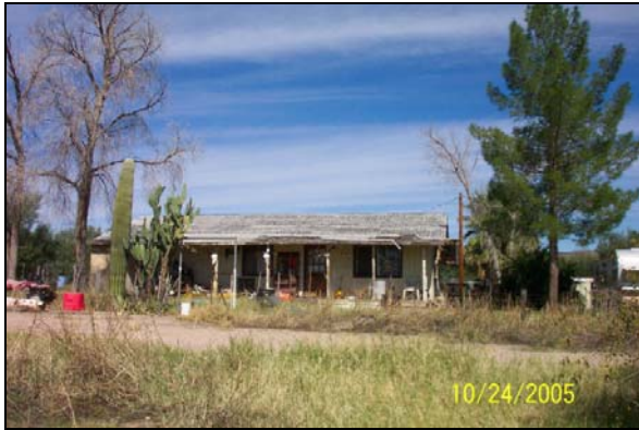
[3] Ranch house