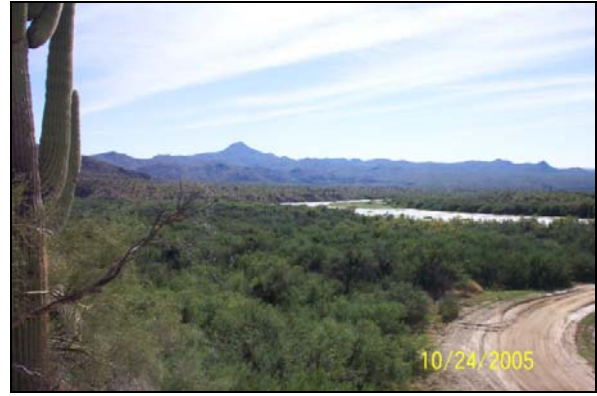
[2] Deeded land along the Big Sandy River