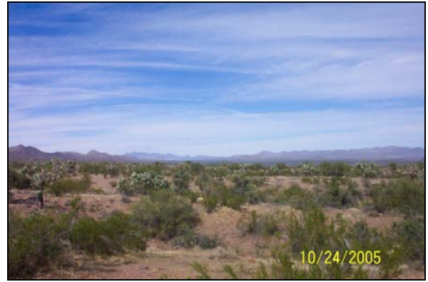
[11] Typical rangeland on Western portion of ranch