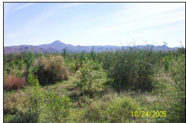
[8] Abandoned irrigated pastuer

Disclaimer: This information was obtained from sources deemed to be reliable but is not guaranteed by the Broker. Prospective buyers should check all the facts to their satisfaction. The property is subject to prior sale, price change, or withdrawal.