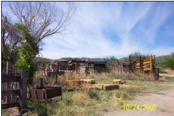
[5] Corrals at headquarters