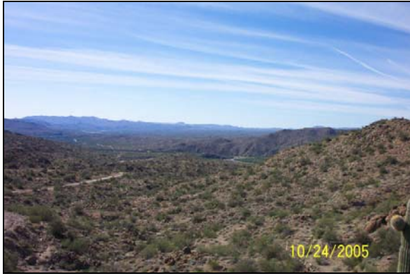
[1] Big Sandy River near the NE boundary of the ranch