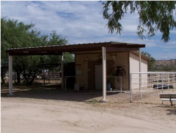
Tack room w/ shade